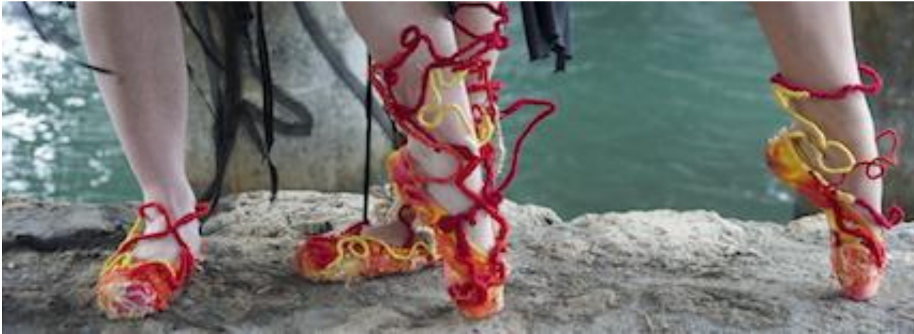
Image: Remnant Dance