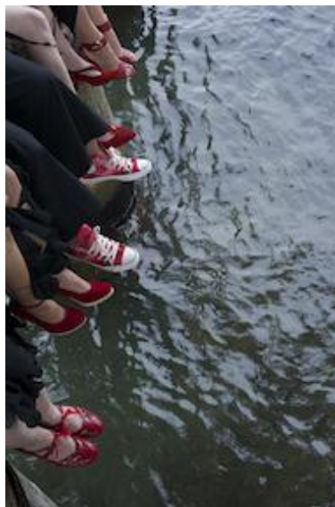
Remnant Dance