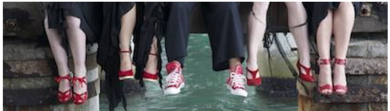
Image: Remnant Dance

CDFA has been Connecting Dancers of Faith in Australia for over 30 years